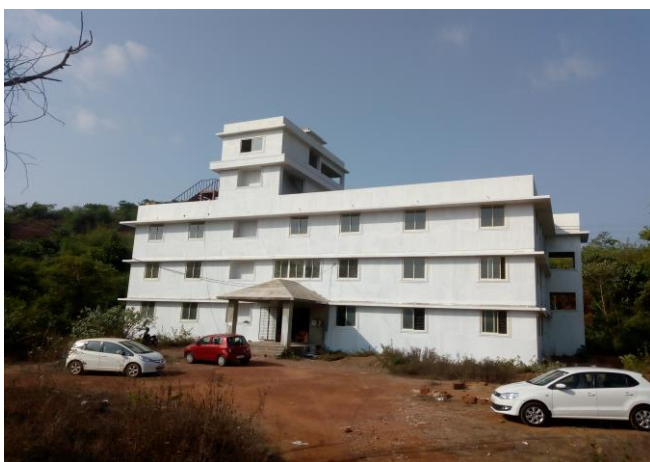
Dilasa Rear view 30.4.2018